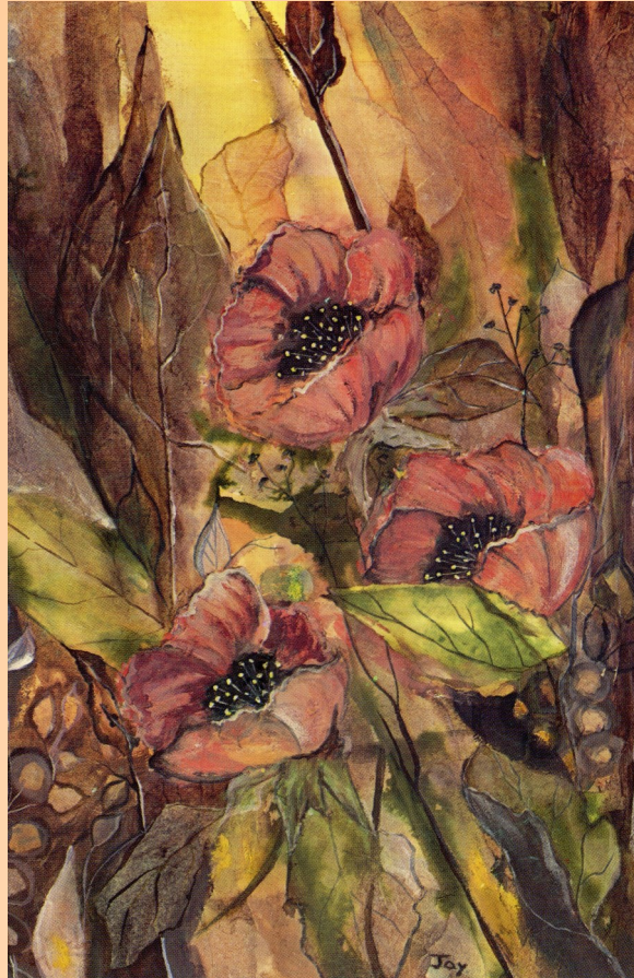
The Coffee Bean

The Coffee Bean was part of Joy's 15 piece Appalachian collection. Done in watercolors, the coffee bean is a mass of muted tones in peach, yellow, warm greens, blushed with browns, complimenting the three fully opened blossoms in shades of rose.